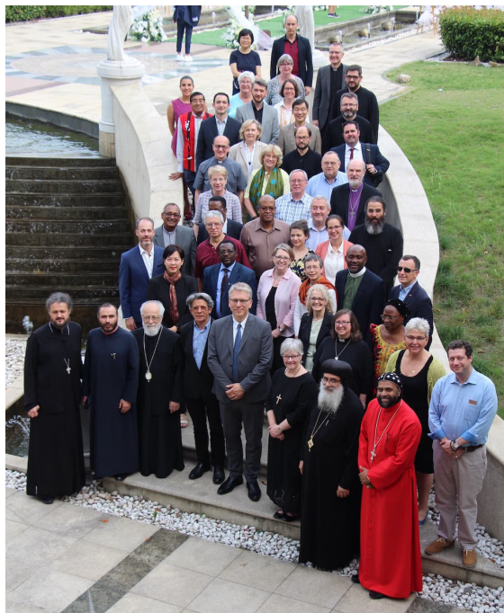
The Faith and Order Commission in session