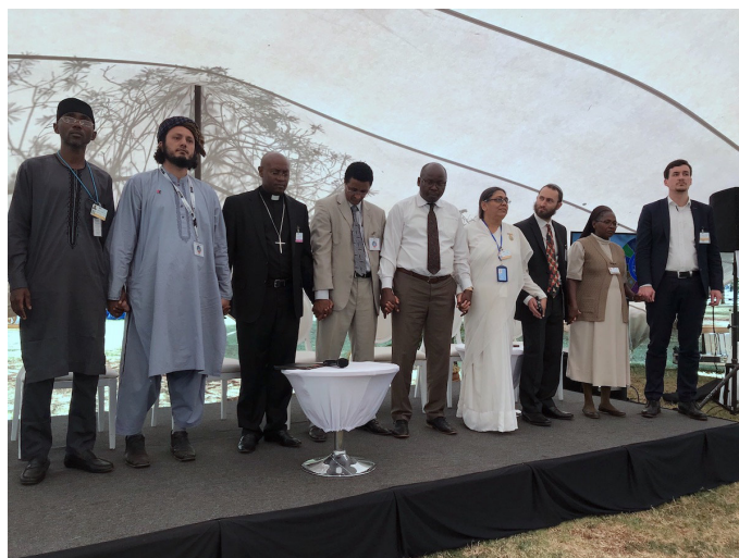
Representatives of various faith traditions at a side event in the context of the Faith for Earth Initiative at the UN Environment Assembly (2019)