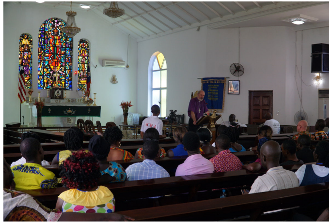
Lecture to the National Council of Churches of Liberia

Jesus taught us, said Schirmmacher, that the real evil comes from our hearts, which is why, for Christians, attitudes like racism, corruption, discrimination, or misogyny cannot be overcome by external factors only, but that a profound conversion of the whole personality is decisive for it. But the state cannot create or enforce such a conversion and has to provide for external justice.