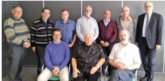
Group photo

leadership. It provides recognized benchmarks for informal and non-formal biblically-based ministry. It is based on outcome- and impact-based assessment. Re-Forma will not do the training itself but will cooperate with many global and regional organizations engaged with non-formal theological education. We will provide the framework for a standard outcome assessment that is valid globally. Re-Forma plans to award a Certificate underwritten by the World Evangelical Alliance.”