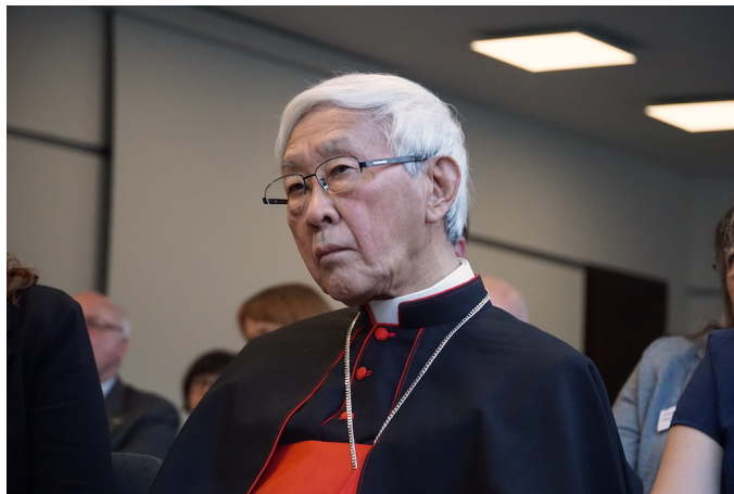
Cardinal Joseph Zen Ze-kiun listening to the laudation for him