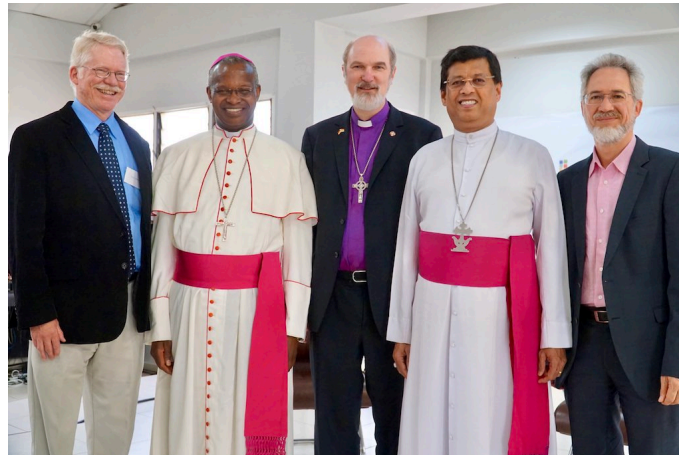
Three speakers of WEA with the Catholic Archbishop of Ghana and the Anglican Archbishop of Sri Lanka