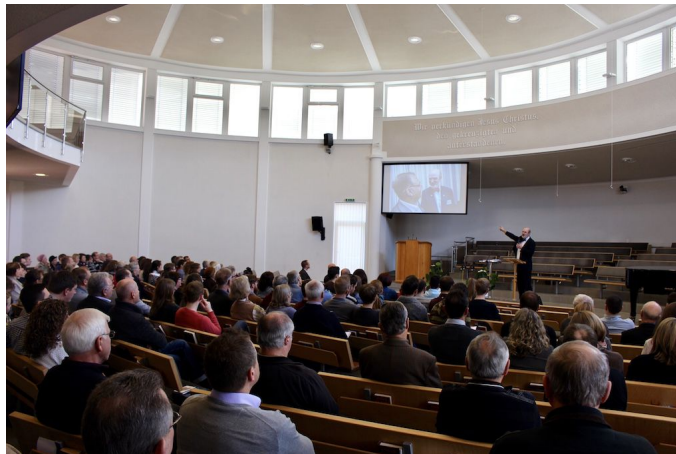
During the seminar

Since the Christian faith rejects spreading the faith through coercion, force, or through the state, according to Schirmmacher, the Jesus' church is having to endure increasing expressions of enmity against it politically or through the use of force and human rights infringements. It is often the case, however, that at the same time the hearts of people are won who often shed the violence within their own religion or worldview and open up to