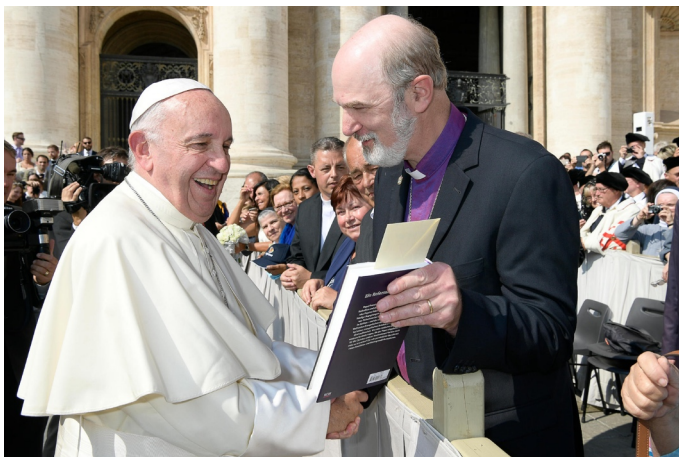
The Pope expresses his pleasure regarding the first copy of “Coffee Breaks with the Pope”