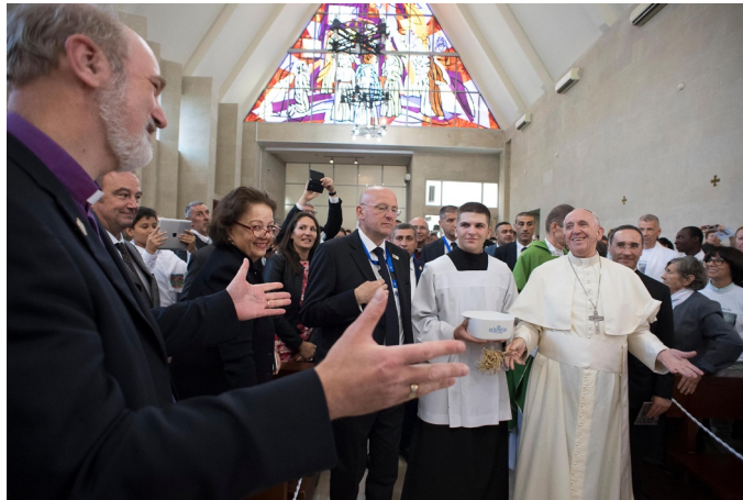
Discussion of the book and a tribute to the papal photographer in Baku