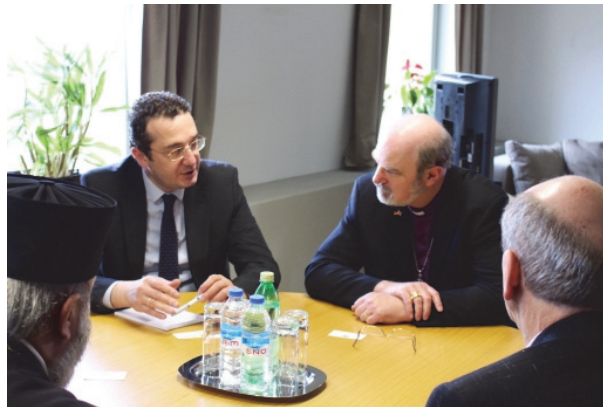
Hahn and Schirmmacher in conversation with the European Minister. David Bakradze

Schirmmacher, the author of a book against corruption, has congratulated the Prime Minister, Giorgi Kvirikashvili, and the European Minister of Georgia, David Bakradze, on their successful program against corruption at all levels, in everyday life all the way up into the higher echelons of politics and the business world. In 2004, Georgia held the atrocious position of 131 on the corruption index put out by Transparency International. In 2014 it held the 50 th position, the best value of a post-Soviet state with the exception of the Baltic region.