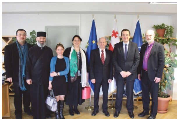
The delegation with the European Minister

At the same time, everyday corruption has almost completely disappeared. This shows that the population also desires to leave the past behind. Georgia, which in view of Russia has not even been admitted as an EU entry candidate, is thus not only a role model for EU entry candidates but has rather surpassed seven EU member states, such as Italy and Romania, on the corruption index.